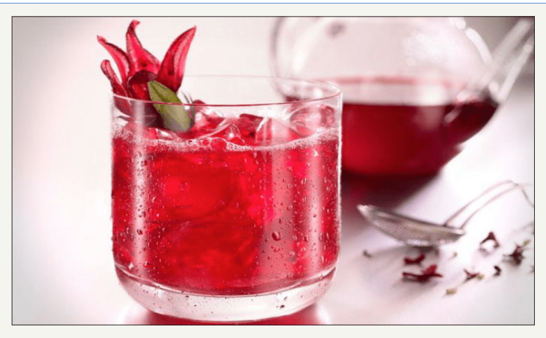
Figure 1: Karkadi natural Sudanese drink

Sudanese local natural local drinks are very healthy, cheap and easy to obtain in comparison to soft drinks which are expensive and harmful. Tabaldi is one of the most common natural drinks especially in the west of Sudan and it protect the circulatory system by controlling the level of cholesterol so it prevent heart diseases which are rarely seen among people in the western of Sudan in comparison to other areas in the country. Karkadi is another Sudanese natural drink which plays an important role in controlling of blood pressure Figure 1.