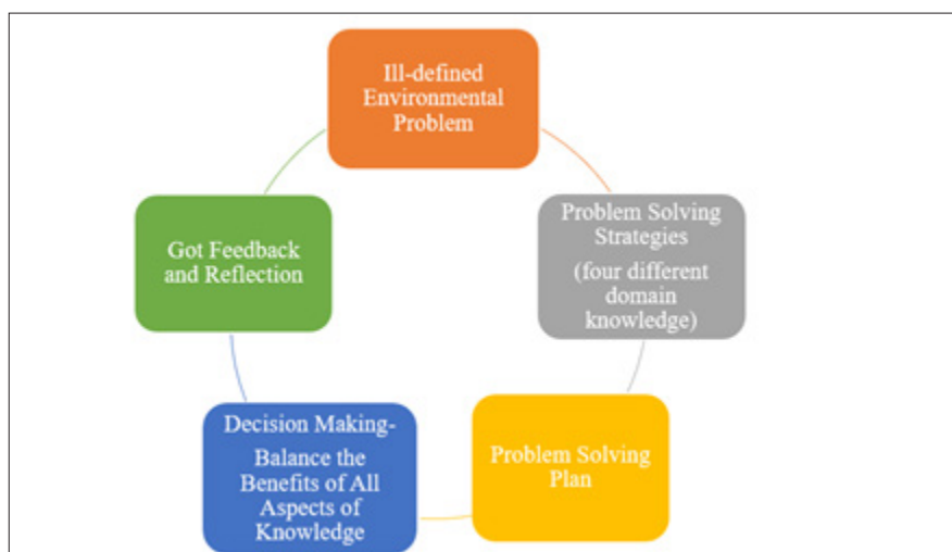
Figure 1: The conceptual framework of EPBL.