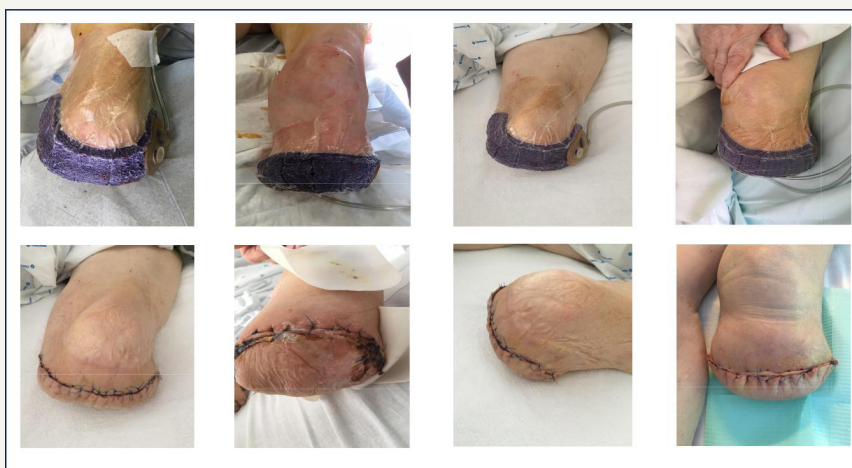
Figure 1: above - with ciNPT at day 0 (postoperatively) down - at day 7 when ciNPT was removed.

The vascular surgery population is at an increased risk of surgical site infections related to peripheral vascular disease, diabetes, obesity, previous surgery and presence of tissue loss. Negative pressure wound therapy dressings have been used on primarily closed incisions to reduce surgical site infections in other surgical disciplines. The mode of action of NPT on a closed surgical incision is notably different from the mode of action in open wounds. The combined effects of reduced lateral tension, improved lymphatic clearance, and reduction in hematoma and seroma may contribute to faster and stronger healing with reduced risk of infection and dehiscence (Figure 1).