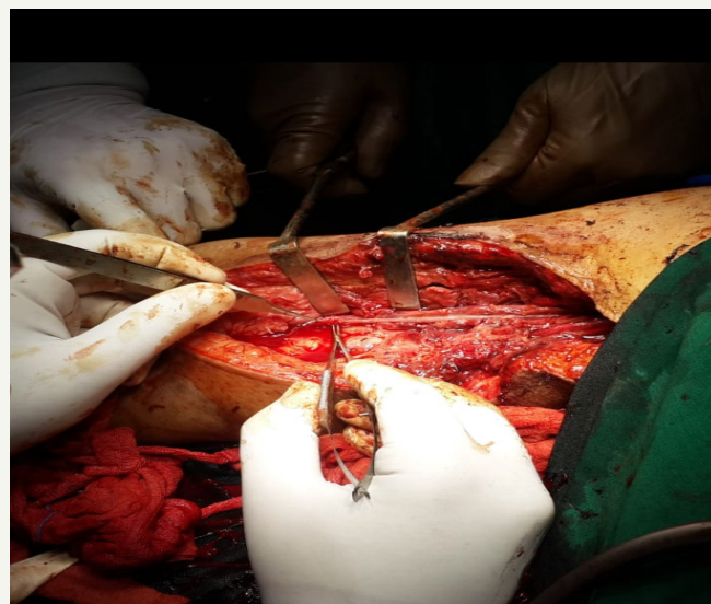
Figure 3: shows greater saphenous vein graft with end to end anastomosis of the vessel and debridement of soft tissue.