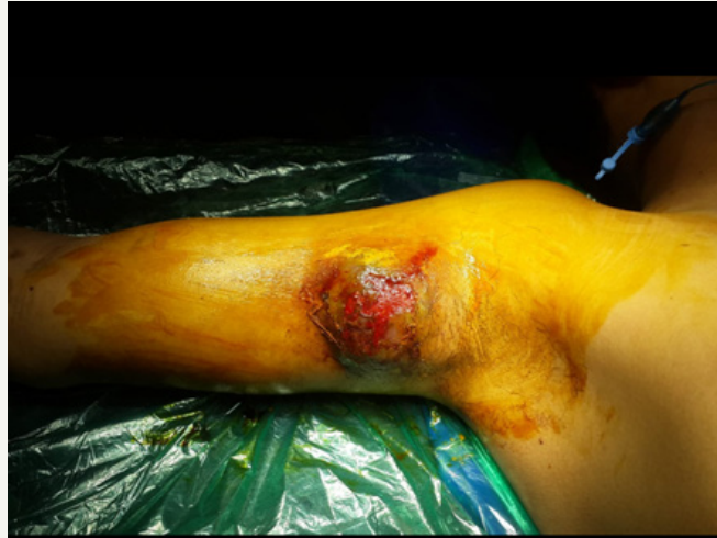
Figure 1: Preoperative swelling of right axilla showing Haematoma in the axilla.