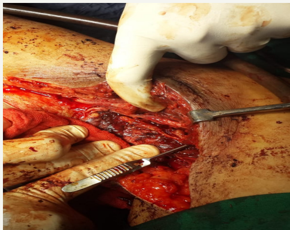
Figure 2: Shows Intraoperative image after exploration and proximal control of axillary artery showing the ruptured segment of the axillary artery with surrounding fibrosis around the artery and necrosis of few fibres of median nerve.