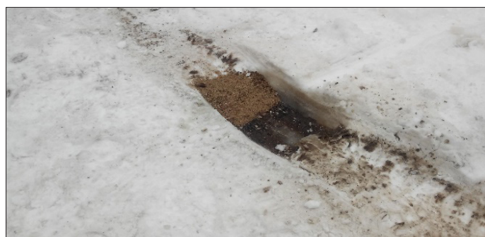
Figure 7: Departure of the car from hole with adding: a) – left hole; b) – right hole.