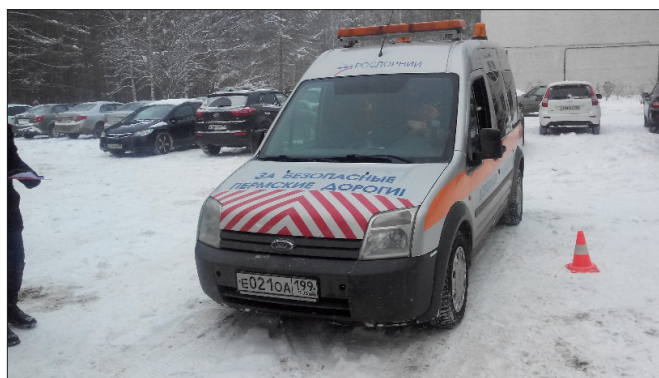
Figure 1: The road laboratory has come out to the venue of experiment..

1) The car approached the place of experiment which for safety was protected with road orange cones (Figure 1);