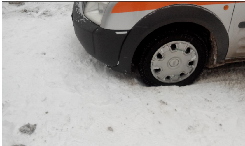
Figure 8: Formation of hole when slipping the car, depth is 0.15m.