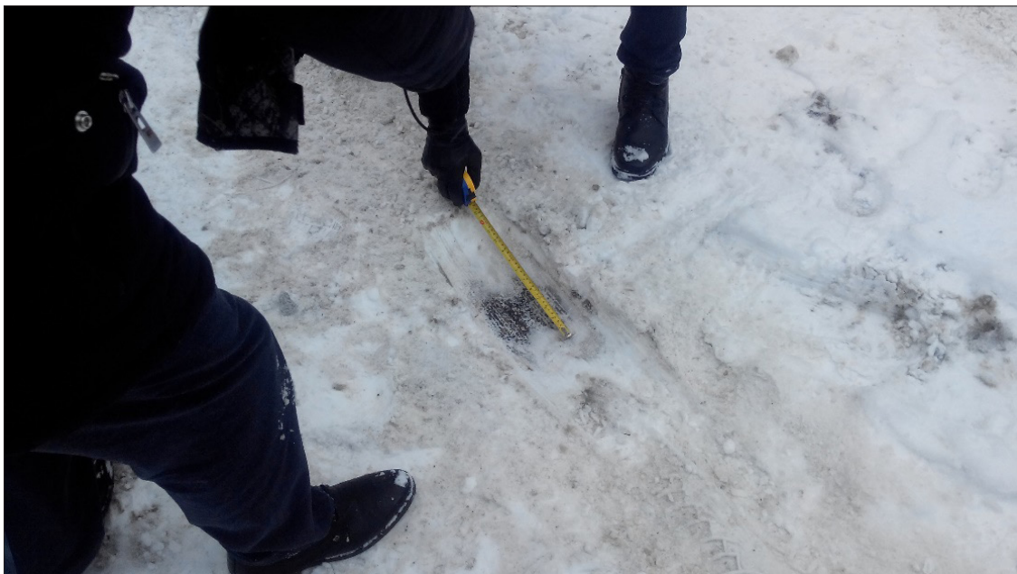
Figure 3: Production and measurements of the second hole.