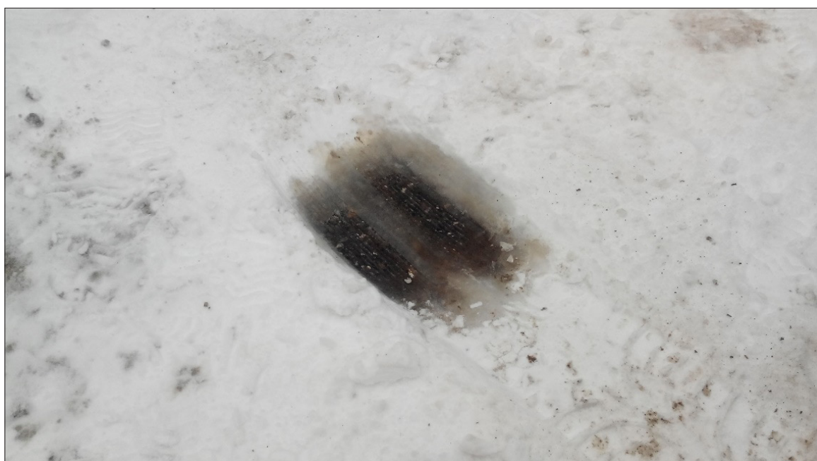
Figure 4: Formation of frost on hole.

13) Then the car slowly ran into these holes and failed in them damping the engine;