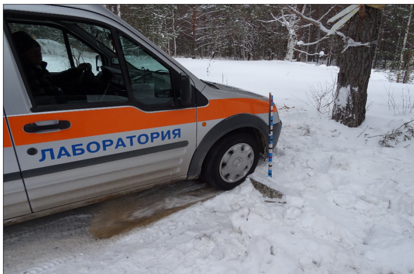
Figure 9: The end of process of arrival on the hill strewed with frictional material.

1120 of material for the termination of process of slipping (Figure 9) was required.