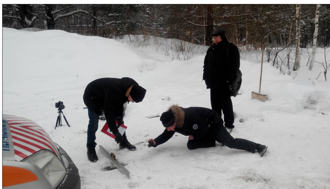
Figure 2: Measurements of the first hole.

8) Photography and measurement of the received hole (Figure 2) was performed;