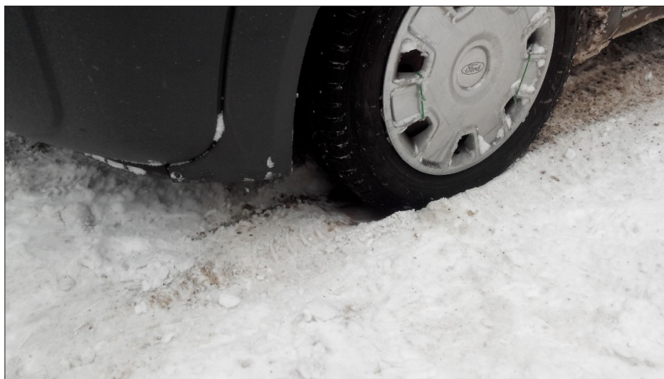
Figure 5: Formation of cone before wheel.

c) To this area under both wheels it is dosed in one portion by scoop (volumetric glass) coarse-grained material (Figure 6) rushed;